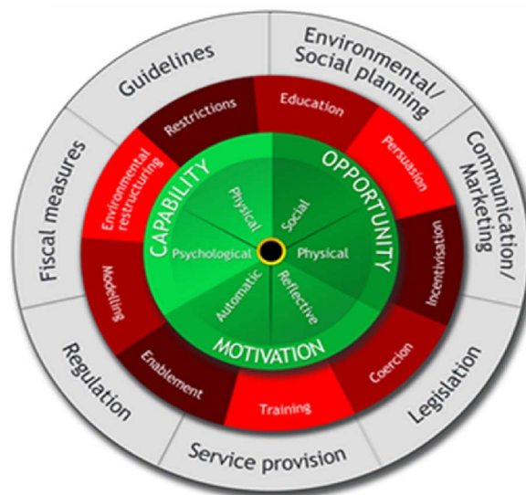
Figure 1 Behaviour change wheel (adapted from Sinnott et al 24 and Mitchie et al ). 25

The BCW incorporates a comprehensive panel of nine intervention functions, shown in figure 1 , which were drawn from a synthesis of 19 frameworks of behavioural-intervention strategies. We determined which intervention functions would be most likely to effect behavioural change in our intervention by mapping the individual components of the COM-B behavioural analysis onto the published BCW linkage matrices... 24